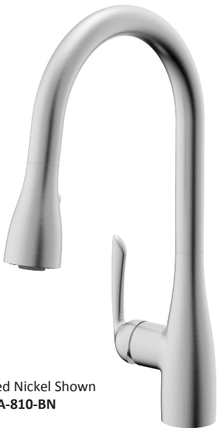
Brushed Nickel Shown A-810-BN